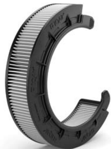
HyperHEPA® Plus Filter